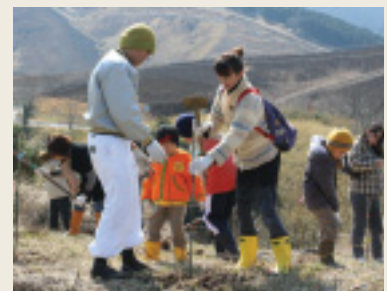
Tokyo Electron Kyushu employees and family members plant trees on Mt. Tawara, Aso.

Tawara in Aso to create a forest to protect the watershed. Based on a 5-year plan, this was the second time trees have been planted by the company. Many Tokyo Electron Kyushu employees and family members participated.