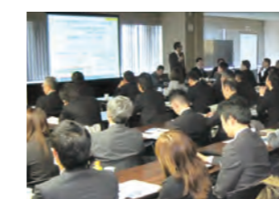
Meeting on implementation of new guidelines for the use of chemicals in products