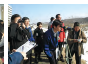
Ecosystem observation event

Domestic plants and offices achieved the goal of recycling 97% or more of waste. All overseas facilities that set targets achieved them.