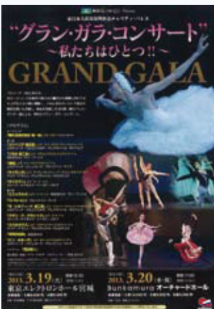
Grand Gala poster