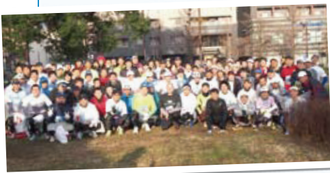
Kumamoto Castle Marathon

We supported the second Kumamoto Castle Marathon as a gold sponsor two years in a row. Over 10,000 runners wearing colorful gear ran through the center of Kumamoto City. More than 120 TEL Group employees participated in the marathon, with well over 80 employees running with all their might toward the goal in the first marathon. TEL employees also participated in the event as volunteer supporters, performing baggage checks, serving meals, and cheering the runners on along the road.