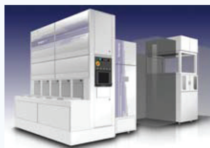
Synapse Series wafer bonding/debonding system