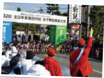
National women's corporate relay marathon (Queen's Ekiden in Miyagi)