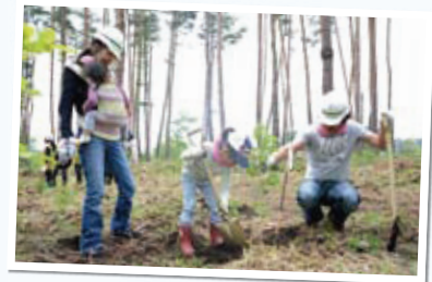
Planting trees in Tokyo Electron Forest